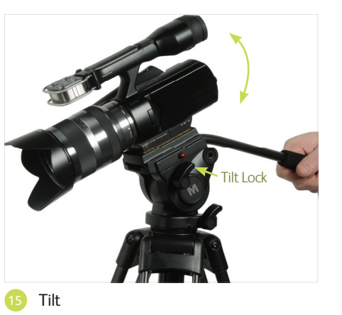
Release the tilt lock knob. Using the pan/tilt bar, move the tripod up or down to tilt.

Release the pan lock knob. Using the pan/tilt bar, move the tripod left or right to pan.